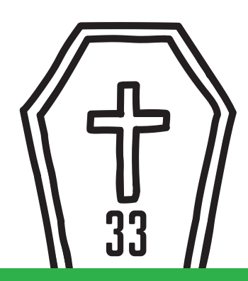
Jesus died when he was 33