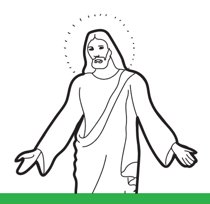
Jesus was resurrected and appeared to His disciples