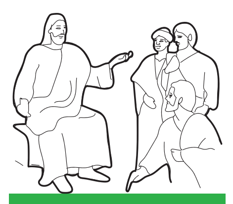
Jesus was a good teacher