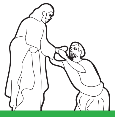
Jesus performed miracles