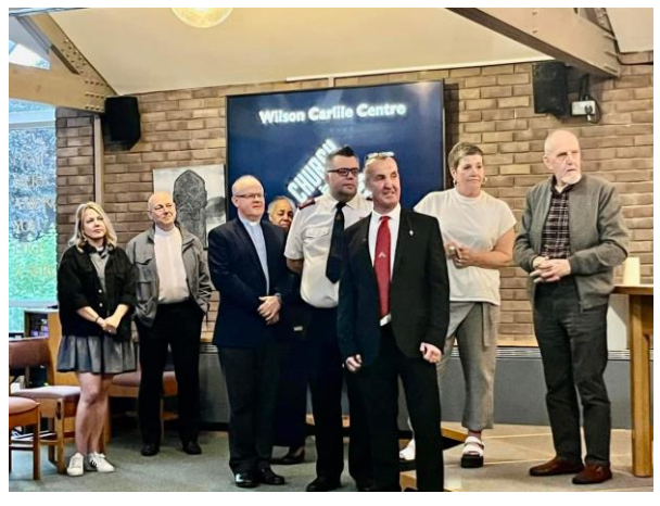
A few of the people from various churches and organisations welcoming me to Sheffield at my licensing service.

Now what have I been up to since landing here in Sheffield?