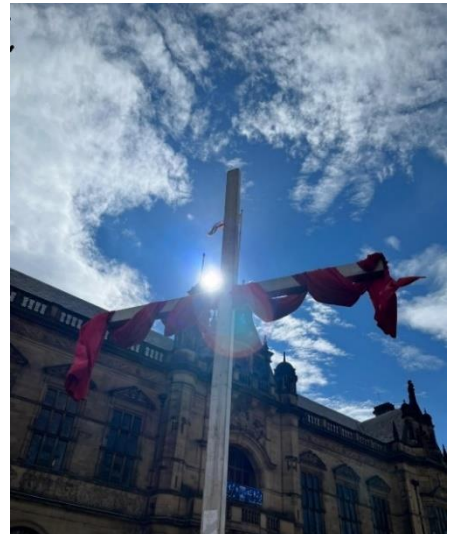
The Steel Cross outside the City Hall during Holy Week

centre work is starting to gel I will be getting a bit more involved there. I have spoken at one of their services as well as being the bingo caller for a pub night they had. Exciting stuff.