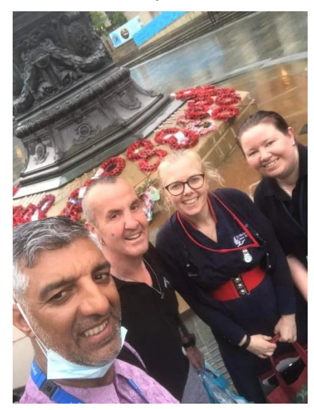
City Centre Outreach with the St. Matthew's Parish Nurses Team.

Then from Palm Sunday through to Easter Saturday we have a team of volunteers offering prayer and talking to the people in the city centre from 11-3. We have lollipop sticks for people to write their prayers on and