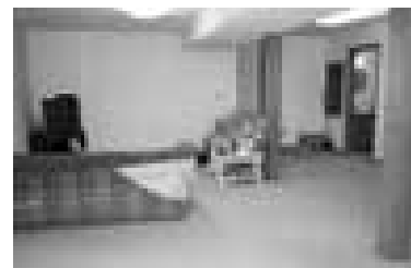
Top: 6th Street House front Middle: Vaughn House inside Bottom: Outdoor House inside

good enough reason, especially if a house could be bought on a main thoroughfare, Church Army Branson opened their first house in August of 1998. They now have three all male houses. Vaughn House opened in 2000 with room for 10 people. 6th Street House also opened in 2000 for 7 people. Outdoor House opened in June 2002 and holds 8. Tim, as the leader of Church Army Branson and “chief grant application completer” is landlord.