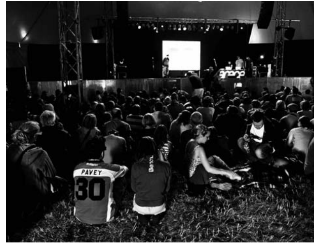
Grace at Greenbelt

Members admit Grace may well work because members come from largely professional backgrounds, bringing a confidence and competency to the group that could be absent if attempts to reproduce Grace were made in other contexts. Furthermore, there is something about being based in London that helps; the city and all its creativity means Grace members seldom run out of ideas. Other characteristics of living in the city include people's reliance on the internet to find