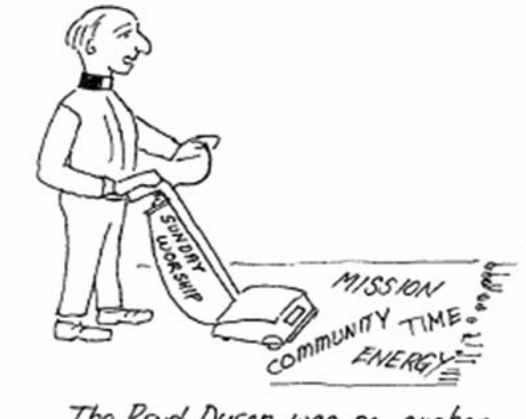
The Revd Dyson was no sucker.

They have opted for team leadership where roles are allocated and no one shoulders the burden of too much responsibility. The strength and stability of these churches is