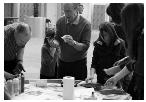
St Peters making the mosaic cross

The language of sodal and modal is now becoming better known. Sodal church is specific, highly intentional and flexible. Modal church is generalist, settled and territorial. One danger is that the two are seen as black and white opposites and people fail to realise that they can be seen as spectrum with examples between the polar ends. These spare-time led churches are a case in point and their recognition will be hindered by modal church that thinks parochially. For those