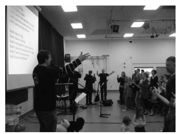
St Peters Family Service