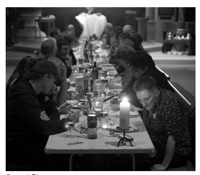
Grace at Dinner

Two other temptations are faithfully resisted. Firstly, Grace refuse to provide for people wanting to join who are looking for the weekly patterns and complex provision of an inherited church i.e. small groups, a dedicated children's programme, twice daily public worship and local community outreach through groups. For Grace , the three planning meetings leading up to the monthly