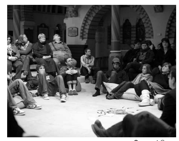
Group at Grace

Over the years, they have been very grateful for the way they've avoided having a stipendiary leader, although they are quick to point out this was no great wisdom on their part at the time; they've only realised it in hindsight In other fresh expressions of Church, they have witnessed the 'strings' that come attached with money and they are grateful for the freedom they've had to develop in their own way and at their own pace without the often unrealistic expectations of growth