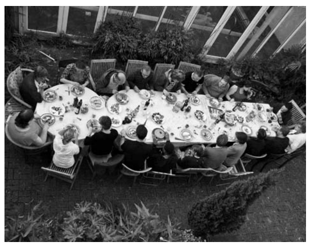
Grace weekend away

On reflection, despite their intermittent sodal characteristics. these churches are modal. One reason sodalities exist is to renew modalities, so to find values of high intentionality and high commitment in fresh missional modal churches needs to be warmly welcomed. However, I do fear that if sodalities are in grave danger of being unrecognised by the wider church, then these churches that are modal with sodal characteristics fall somewhere between the two models and will