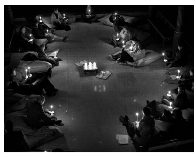
Candles at Grace