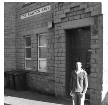
Idle Salvation Army

the groups. By September 2007, they realised they were asking too much and changed the pattern to a shorter time in small groups and having fewer of them. In addition, it was not always easy to hold young leaders on a Friday with all else the area offers. They did, however, establish a shape for the evening which included the invention of the 'debrief'. If an incident occurred, or the evening was amazingly successful or discouragingly hard, the young people could call for a debrief and together later that night at 9 pm they would work out why and what to do about it with Andy and Tracy.