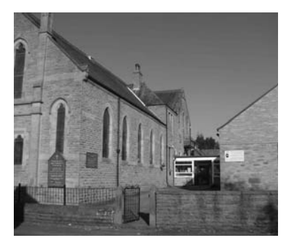
Thackley Methodist Church

people decided what they wanted to do and it included a short slot about God and current issues. Yet as October and wet weather arrived, the numbers drained to single figures. The Pod was only a stage not a answer. Enquiry