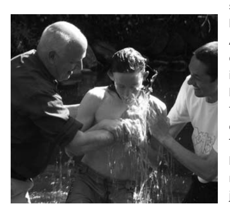
Another later baptism

One external measure of progress was the visit of Bishop David in summer 2007 which publicly connected the work to the diocese and indicated its being approved of. He was to baptise some teenage candidates in the local river, but local flooding made that too dangerous. He returned again in November to the