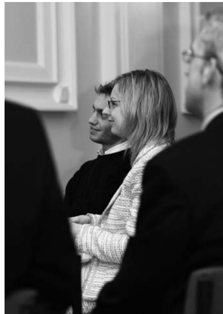
What is said at OASIS is worth listening to.

This is not an issue that is specific to Alpha; it arises for all missions that go out beyond existing church. It is shared by youth workers, people gathering in cafés, those drawn through community development and cell or cluster-based initiatives. Theologically, the task of mission will involve growing church. Relationally, those who find Christ together want to stay together until moved on to multiply their discovery elsewhere. I wonder if we need to stop being surprised that adventurous mission tends to create fresh churches rather than be a recruiter for old ones. This pattern will be even more likely in a network-based society and in one which is diverse.